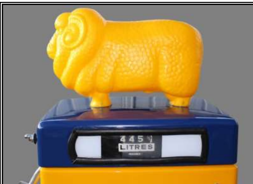
Above: A contemporary photo of the Golden Fleece ram

The historic Sir George Tavern has been totally refurbished and remodelled. This historic hotel now draws large numbers from both Canberra and Wagga Wagga, it being a convenient half way point between the two towns. Prices are very reasonable and an interesting day can be had exploring the features of the hotel and of Jugiong itself. Attractions include the Sergeant Parry Memorial.