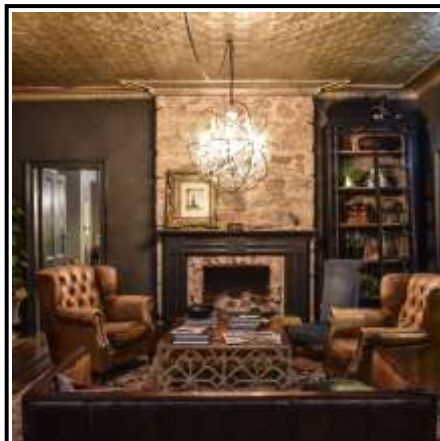
Above & below: The Sir George Tavern

The historic Sir George Tavern has been totally refurbished and remodelled. This historic hotel now draws large numbers from both Canberra and Wagga Wagga, it being a convenient half way point between the two towns. Prices are very reasonable and an interesting day can be had exploring the features of the hotel and of Jugiong itself. Attractions include the Sergeant Parry Memorial.