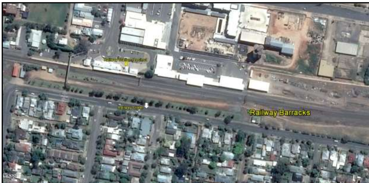
Above: Map of railway precinct areas.