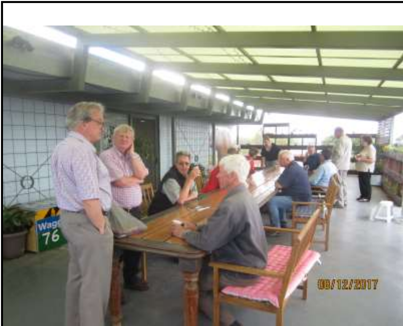
Left/below: morning tea on the deck