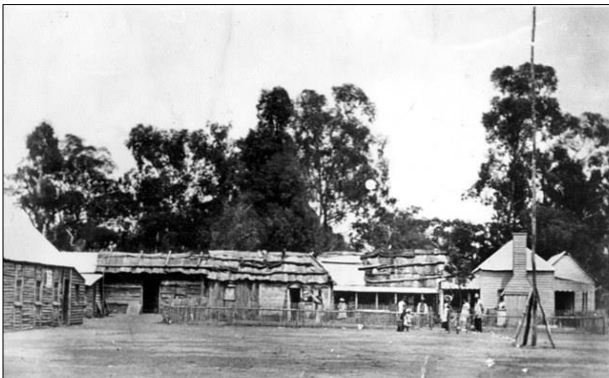
Above: Part of the old Warangesda Mission.