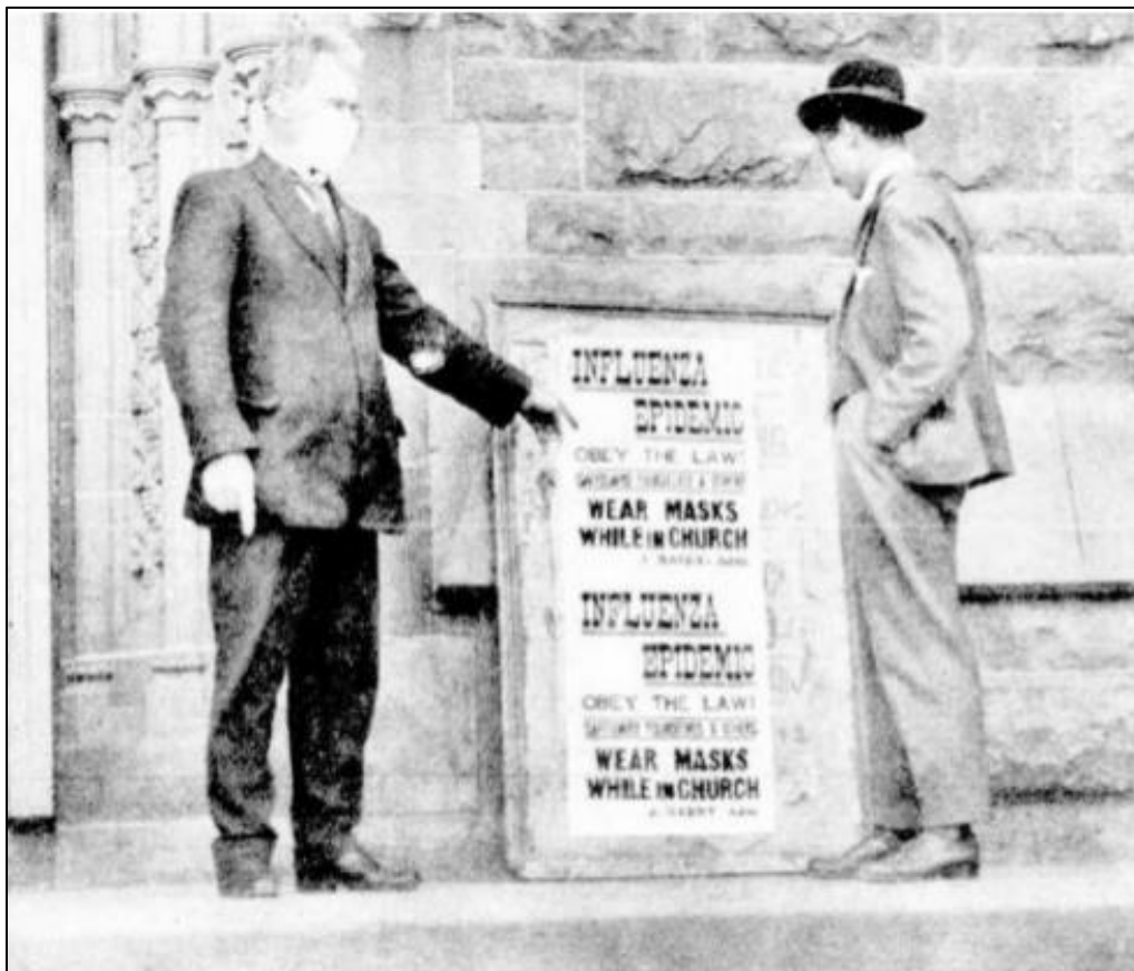
Above: A sign outside a Melbourne Church. 23

By the time the 1919 epidemic had run its course some four hundred and fifty one cases would be officially confirmed in Wagga Wagga, and thirty two of these people would have died as a consequence.