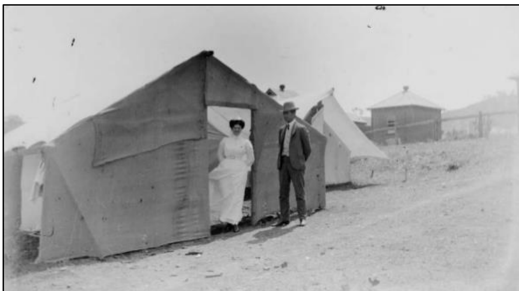
Above: A nurse in a temporary isolation ward tent at Gundagai.

There were never enough nurses to meet the demands imposed by the epidemic. 249