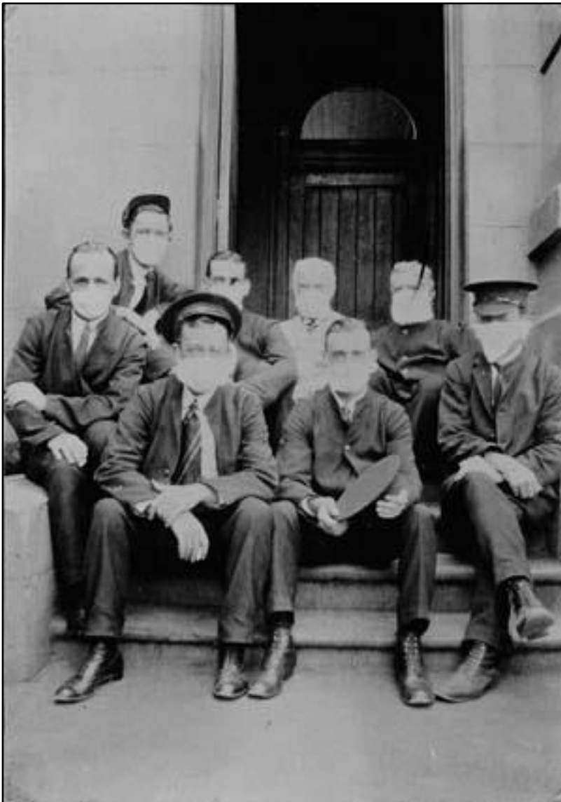
Left: Staff at the Balmain Post Office wearing the prescribed masks. [NAA: C4076, HN558]

The government encouraged all citizens to wear masks, indoor and outdoor. 63