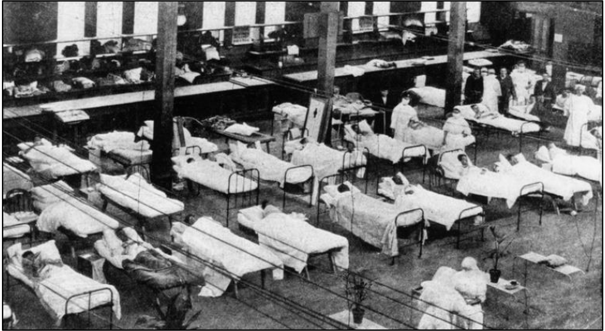
Above: The Men's ward inside the Royal Exhibition Building, 1919 [Melbourne].

14 th April – There have been eight more admissions to the hospital. Five on Saturday and three on Sunday. 64 One patient had been discharged leaving a net total of forty patients. There were another forty persons quarantined in their own homes.