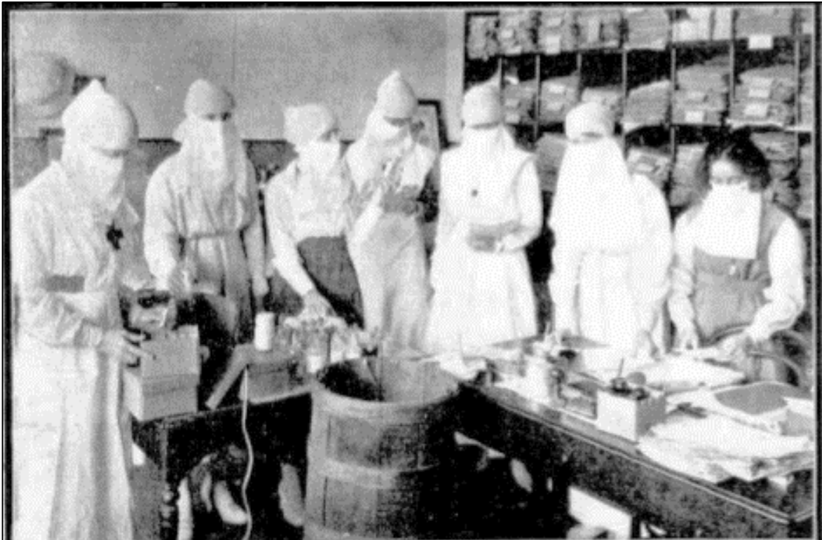
Above: A group of ladies from the Board of Health and the Red Cross Society, helping to package doses of the influenza vaccine from the Health Department in Sydney.