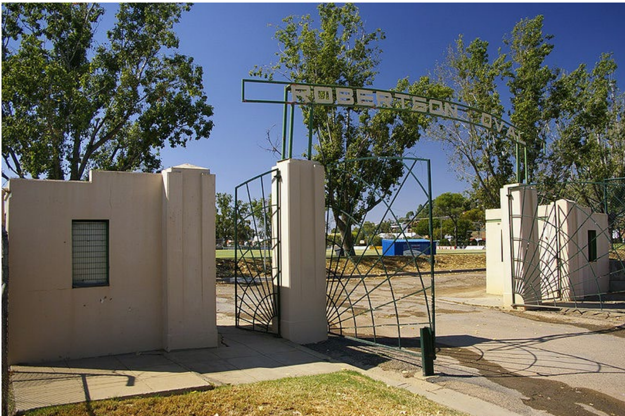
Above: Robertson Oval gates in more recent times.