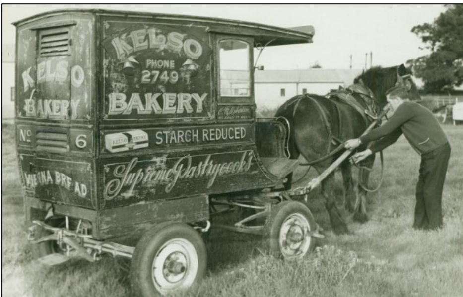
Above and left: Kelso Bakery Carts. The two horses above right were 'Nigger' (the black horse on the right) and 'Toby' (a bay, on the left) pictured after their final bread run, August 4, 1964.