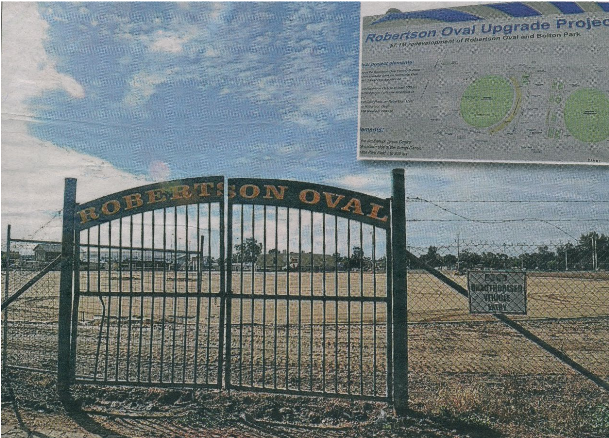
Above: Robertson Oval gates during the Oval upgrade, 2012. The Daily Advertiser, 8 May 2012.